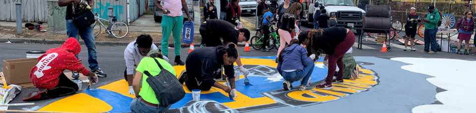
Original Scaper Bike Team, 90th Ave and Plymouth St