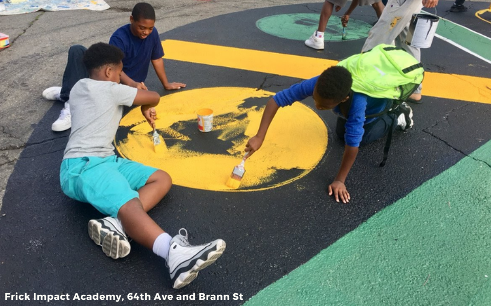
Frick Impact Academy, 64th Ave and Brann St